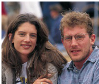
Reasons for cautious optimism

recovery during April was by no means uniform, with an early bounce-back hampered by Portugal's debt downgrade and yet another earthquake in Japan. However, relatively good jobs data in the US - somewhat tarnished by subsequent warnings that the US debt situation must be addressed or there could be a downgrade there too - helped all the main indices we track to grow over the month. The FTSE250 gained 3.64%, while AIM ended 2.19% higher. This leaves the mid-cap market almost 16% up on a year ago and the FTSE100 index over 9% higher.