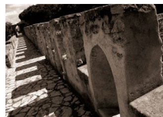
Portugal may soon need its historic battlements

Portugal, the latest Eurozone country to apply for an emergency loan, has had its long-term credit rating downgraded by Moody's from A3 to Baa1 (not much above junk status, in simple language). This is worrying partly because of suspicions that Greece will soon have to seek fresh lines of credit, or risk defaulting on its borrowings. Greek bond yields - effectively the cost of its borrowing - have recently exceeded 12%, compared with less than 4% for Germany.