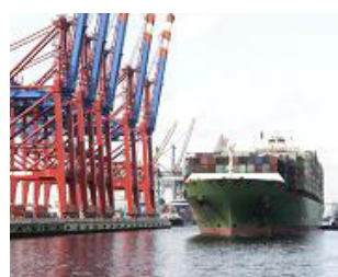
Exporting is essential, if we are to reduce reliance on services

While it may be an exaggeration to say that we cannot survive without a strong manufacturing and export sector, it is certainly true that we would be better off if we made and exported more. However, we have few natural resources so we have to import most raw materials. It is therefore the 'added value' in