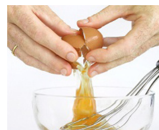
You can't make an omelette without breaking some eggs

Following a reduction in the estimate of how much GDP fell during 4Q10, the Office for National Statistics has just released its first estimate for the 1Q11 at a widely-expected 0.5%. This comes as a massive relief to those who had feared a combination of cuts in Government spending and higher VAT would tip us back into recession - the so-called double-dip. It is also a better trend than the US, where 1Q11 annualized growth of 1.8% compared with 4Q10's 3.1%. In fact, had it not been for poor construction output, the UK figure could have been about 0.3% higher than the actual result.