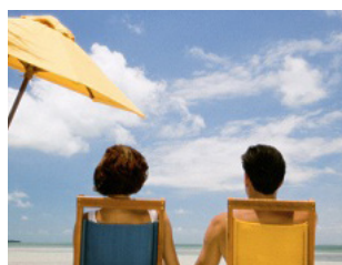
Mediterranean weather may have helped consumer spending in April

With the local government elections (and AV referendum) due within a few days, we can expect more political point-scoring. This will probably centre largely on national, rather than local issues, since the media are more likely to report on issues that affect the largest number of people.